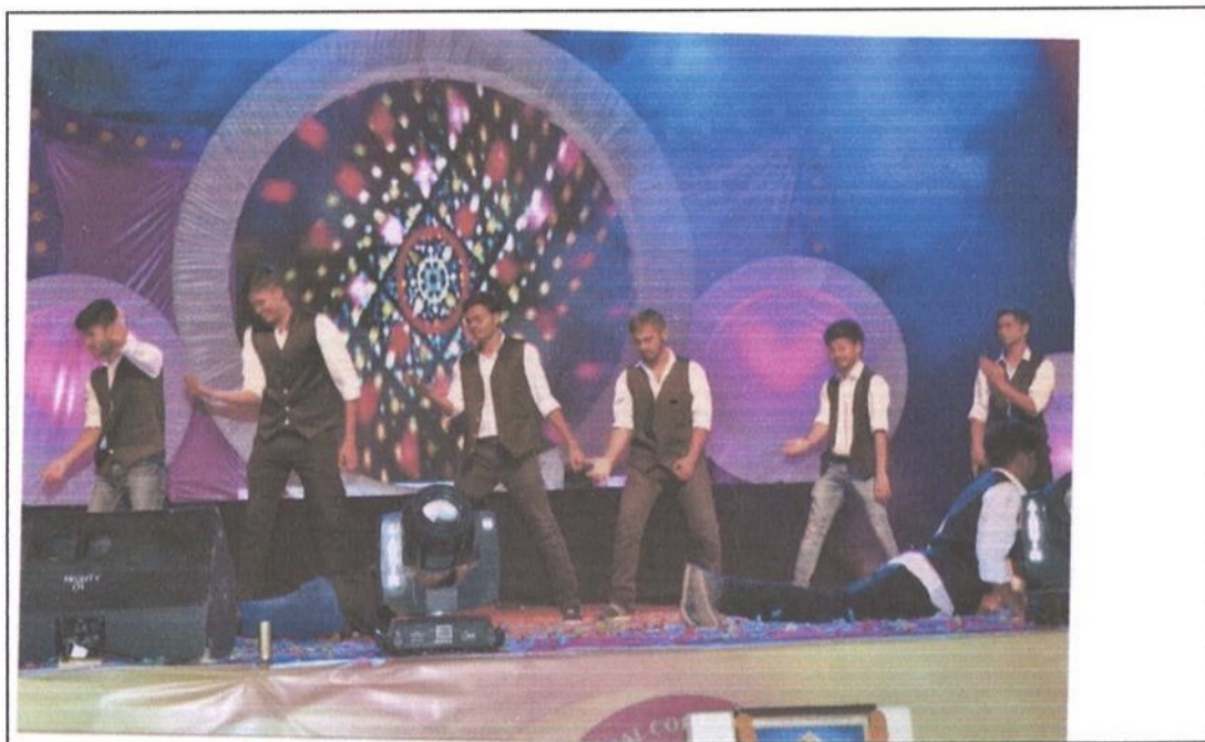
Photo 1 Marwadi dance

Date of program: 21/02 /2017 to 27/02 /2017