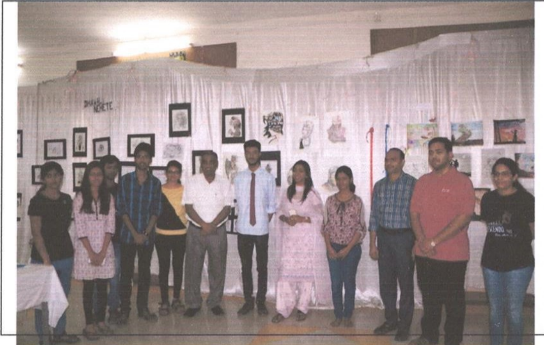
Photo 2 hand writing and photography competition